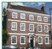
Grade II* listed Dial House, 790 High Road. Built in 1691 for Moses Trulock, a city soap manufacturer. Owned by the Trulock family until the 1830s.

Saturday 1st October. Meet at 11am at Bennetts Close, N17 OHD, cul-de-sac near junction of Tottenham High Road and Northumberland Park (opposite the big new Sainsbury's).