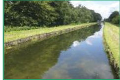
New River Walk near Wightman Road