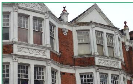
St. James's Parade, Muswell Hill.

Who lived in Denmark Terrace? Why is the Odeon entrance at an