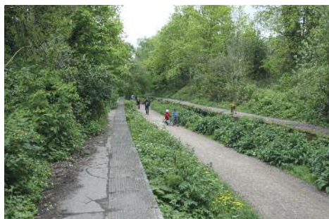
The old railway platforms on Parkland Walk, near Crouch Hill.

Saturday 1st October. Meet at 10.30am at Wells Terrace Bus Station on the north side of Finsbury Park Tube Station.