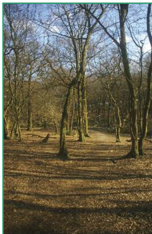
Winter in Coldfall Wood

Buses: 102 and 234 or any bus to Muswell Hill Broadway and walk W7, 144, 134, 43