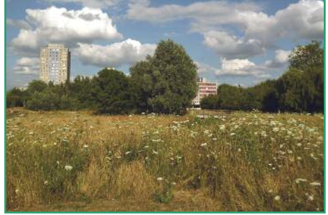
Broadwater Farm Estate glimpsed across the meadows in Lordship Rec

The trail showcases 16 trees on a mile long route through the park. A